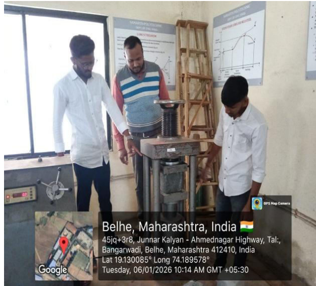
Fig. Compression Testing