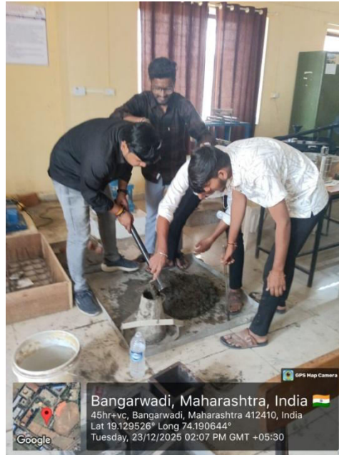
Fig- Fresh Concrete Slump Cone Test