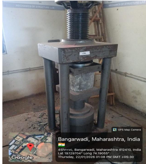
Fig Compression Testing