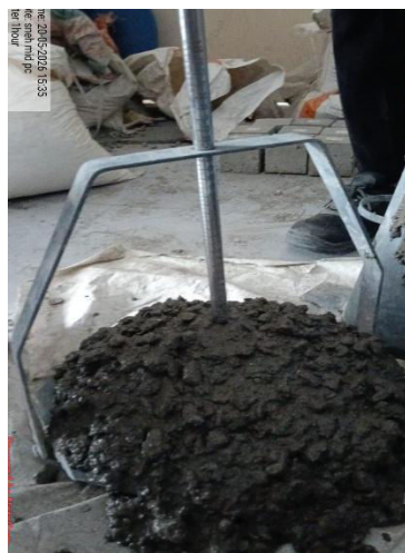
Fig- Fresh Concrete Slump Cone Test