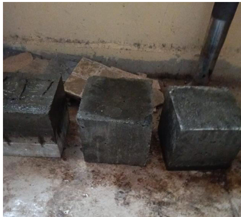
Fig-Replacement Prepared specimen